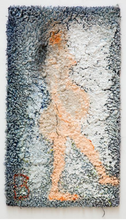
Brook Hsu, Pregnant , 2018