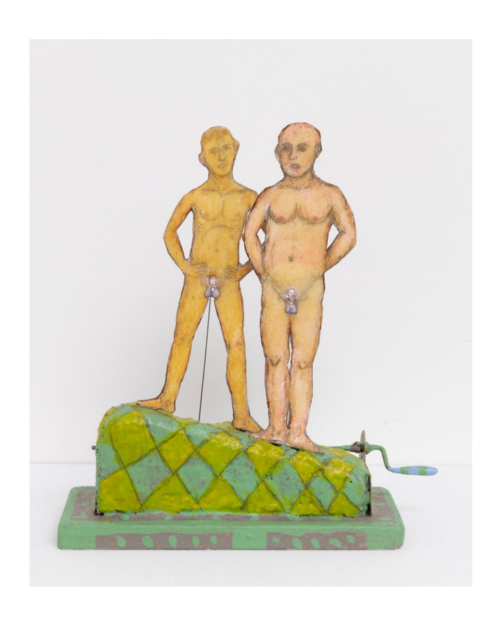
Tom Duncan, S.I.P.P. Study #3, 2018, Mixed media, 6½ x 2½ x 7 inches

Small Worlds was filled with tiny works that could fit even in the tiniest New York apartment. On a small shelf was an intricate metal sculpture, S.I.P.P. Study #3, 2018 by