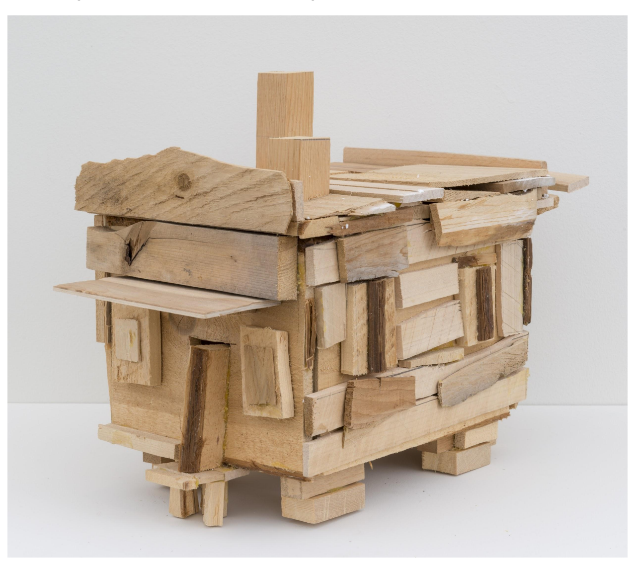
Beverly Buchanan, Turned Over House, 2010 Wood, glue, 13 x 9.5 x 14.5 inches.

Street Shack (1988), of a single tallish home with light brown and blue and yellow walls, along with hints of other color, is filled with the rough crayon colors we often see in this body of work. A window faces us on one wall, with a door on the wall next to it. A luminous light blue frames the house, and some bushes, scrawled in green, occur at the bottom of the drawing.