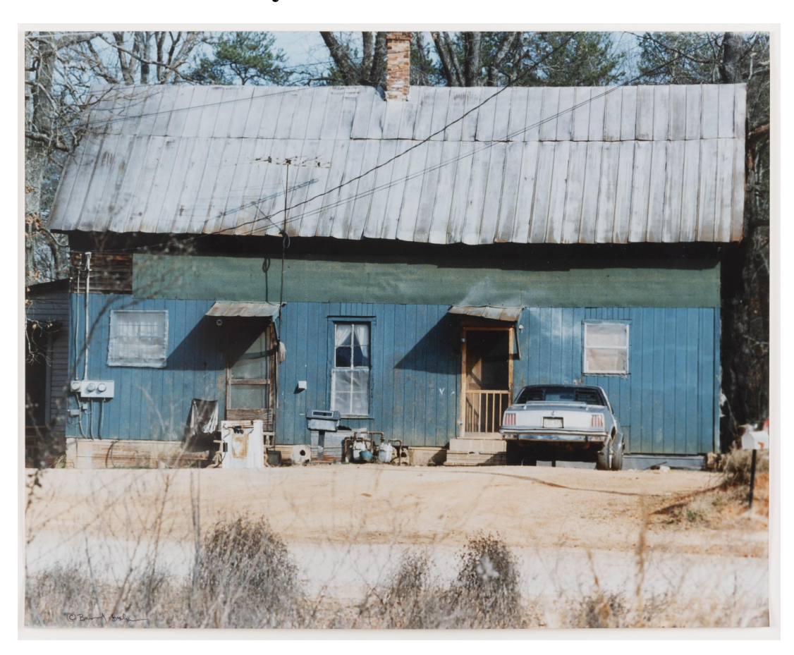
Beverly Buchanan, Saddlebag House Clarke County, Georgia, c. 1995 Color photograph, 16 x 20 inches.