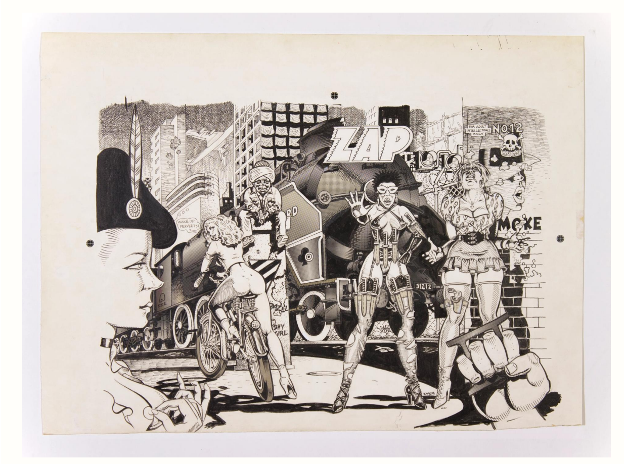
Spain Rodriguez, Zap No. 12 (1989), Collection of Jacaeber Kastor.

"Normally outsider art deals with people that are very individuated, that are locked into their own worlds," Tomaselli says. "This show describes a subculture that's outside of the mainstream, like outsider artists, but connected to one another through a sensibility they share and a social sphere."