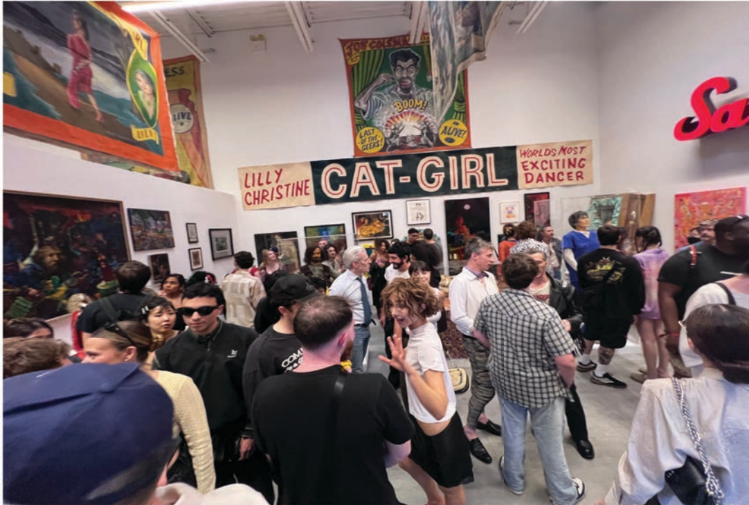
At the opening.